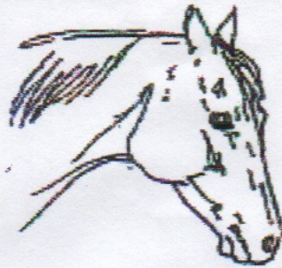
Ears turned back but relaxed listening to his rider or what's behind him.