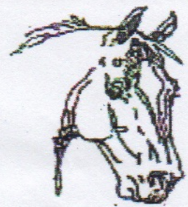
Ears pointed stiffly forward alarmed or nervous about what's ahead. Looking for danger.