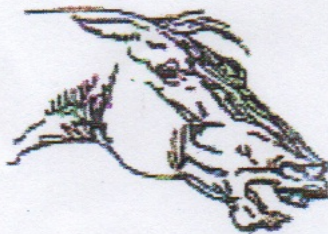
Ears flattened against neck heavily angry, in a fighting mood. May fight, bite or kick.