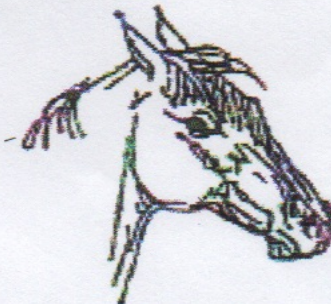
Ears stiffly back annoyed or worried about what's behind him; might kick if annoyed.