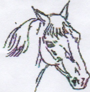
Ears pointed left and right relaxed. paying attention to the scenery on both sides.