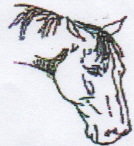
Droopy ears calm and resting. horse may be dozing.